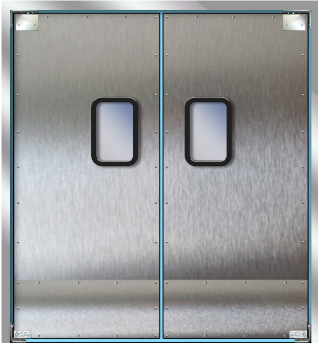
9000SS shown with optional 12" impact plates.