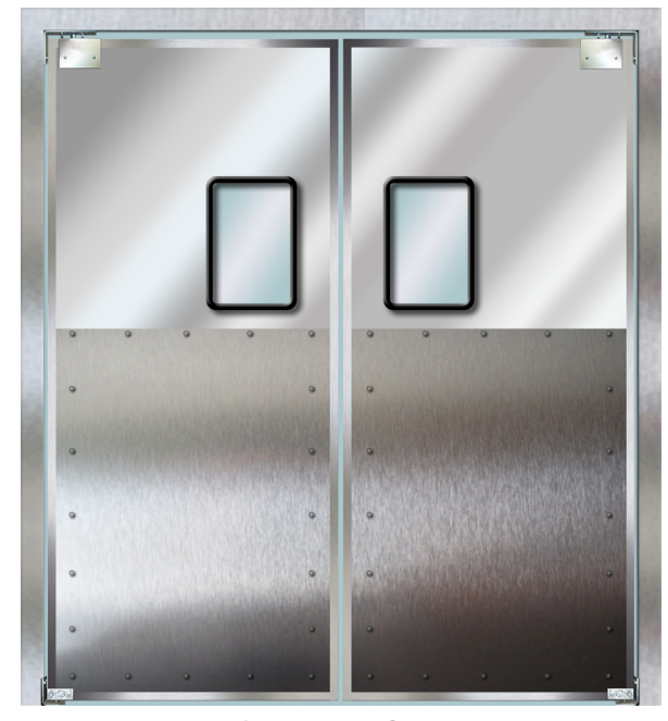
PT - 9000ALC