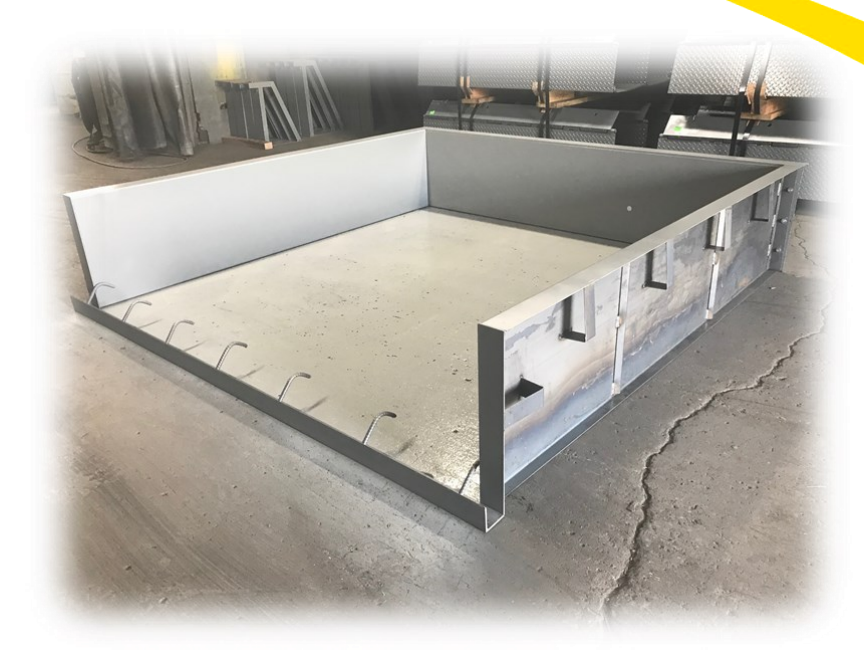
Perma Pits are fast, simple and easy to use. Reducing the cost of building wooden forms with no return to job site for removal.