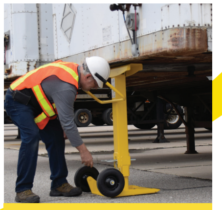
PREVENT TRAILER UP-ENDING