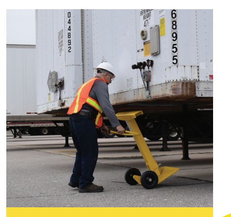
SUPPORT WHERE IT'S NEEDED