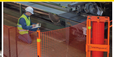
Portable Safety Zone