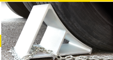
Wheel Chock Safety Systems