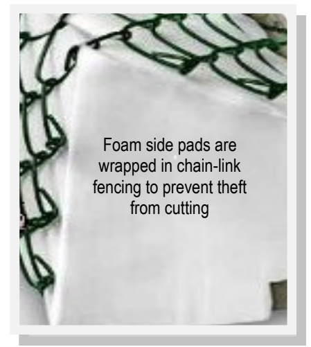
SALES & SERVICE BY: