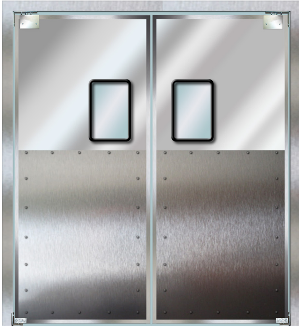
PT - 9000ALC