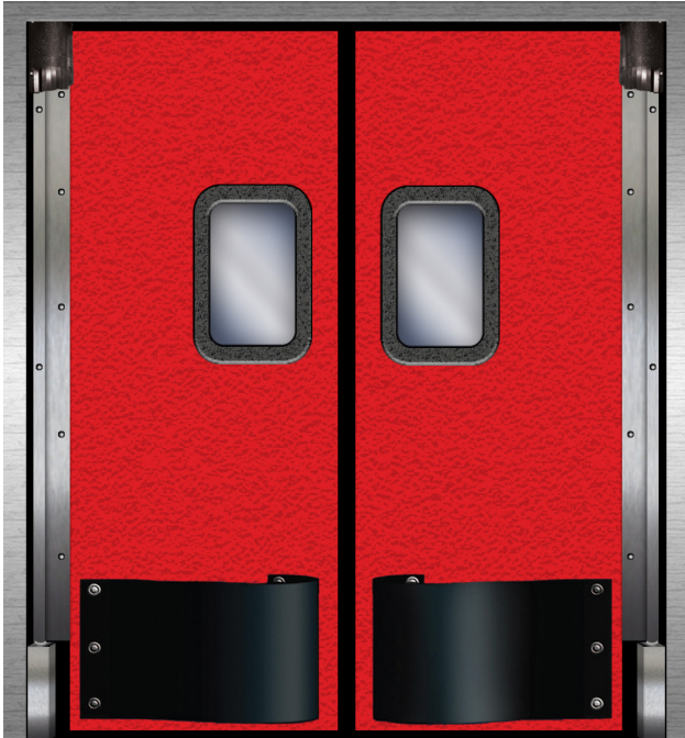
8500 shown with optional teardrop bumpers.