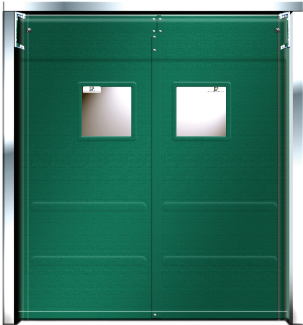
Model 1200 shown.